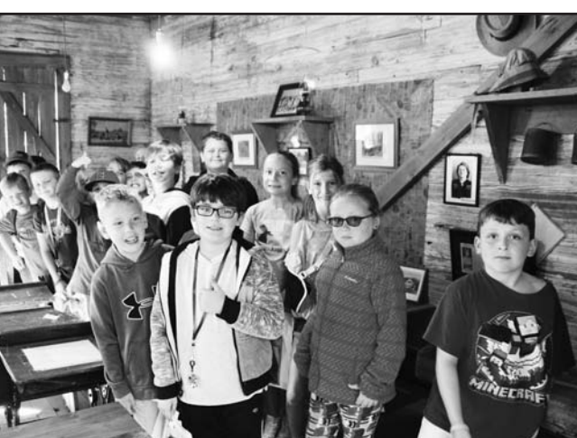
Towns County fourth-graders got a glimpse of how classrooms used to be at the Old Schoolhouse in Pioneer Village last week Photo by Lowell Nicholson at the Fairgrounds.