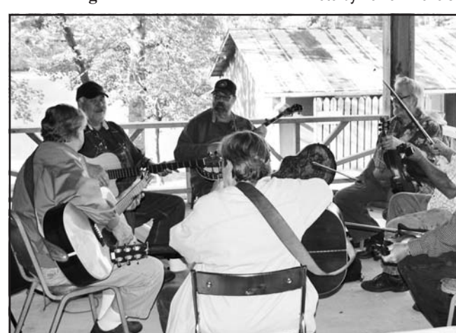
Porch pickin', as seen here at the Georgia Mountain Fall Festival, is a favorite mountain pastime of yesteryear.

I've been coming for about five logging demonstration showing